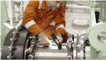
Installation of power measurement system on a thruster drive shaft